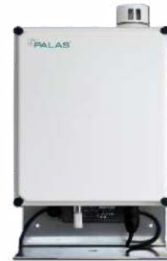
AQ Guard Smart