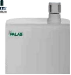
FIDAS Smart 100