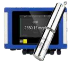
Next Generation UV/VIS Spectrometers - BlueBox RS

Water Analysis Solutions for measurement of COD, BOD, TSS, pH, TOC, OIW, TN, NO3, NO2, NH4, OP, TP, DOC, COLOR, SAC & Others