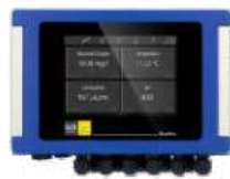
The New Generation Controller - BlueBox R1